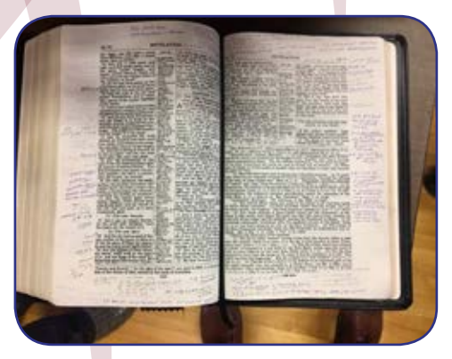
A glimpse at one of the many well-loved pages in Harold Davidson's Bible.